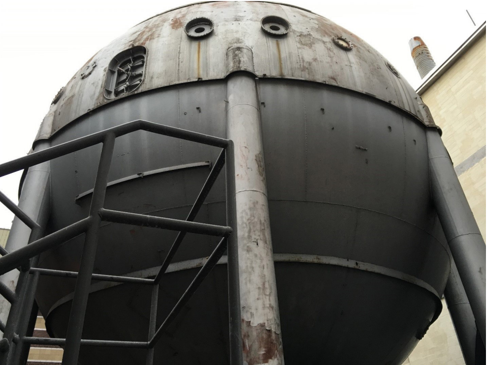
The eight-ball where they once gassed animals with chemical and biological agents is now listed as a historic landmark and cannot be torn down.