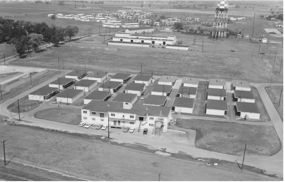
An aerial view of the Animal Farm division at Fort Detrick.