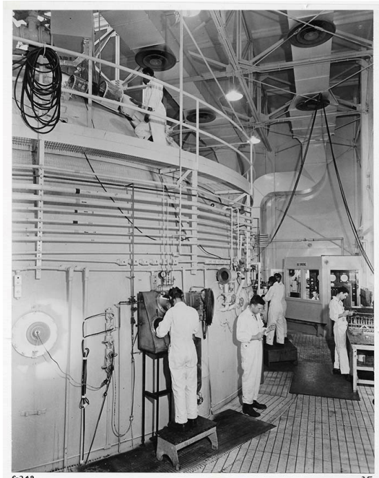
5-243 8th Floor 25 Test Sphere Elevator level showing Test Unit Operator in position during a program trial. Left taking Wet and Dry bulb readings at cabinet number 38. Next, taking building humidity reading behind him are two operators at SHEL cabinet stations. Operator at right with air sampling system. Control room is in the background. Upper picture shows 3/4 level walk way and operator at platform hoist system.